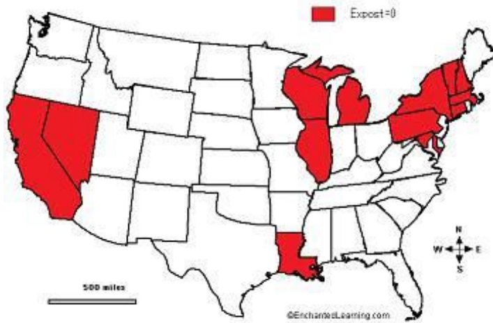
Figure 1: States without ex-post rules in red

The Advisory Commission on Intergovernmental Relations (1984) summarized the stringency of the balanced budget restrictions in an index scaled 0 to 10. This index, labeled ACIR, gives a 0 to states with the least stringent requirements and a 10 to states with the most stringent. Two-thirds of states were given an 8 or higher, and only three states were given scores below 4. Our analysis uses the ex-ante and ex-post rules as well as the ACIR index as potential instruments for cyclicity.