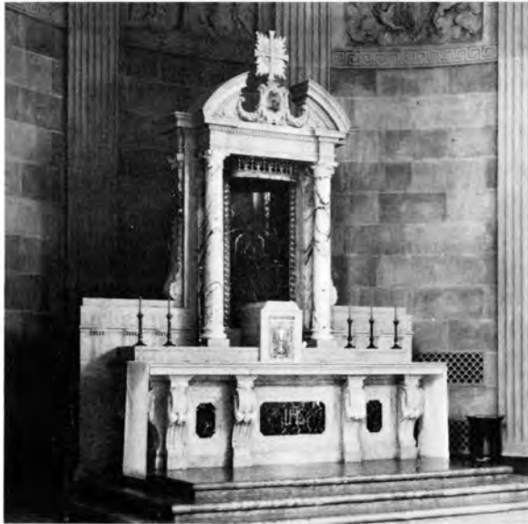
Chapel of the Holy Spirit, Weston, Massachusetts.