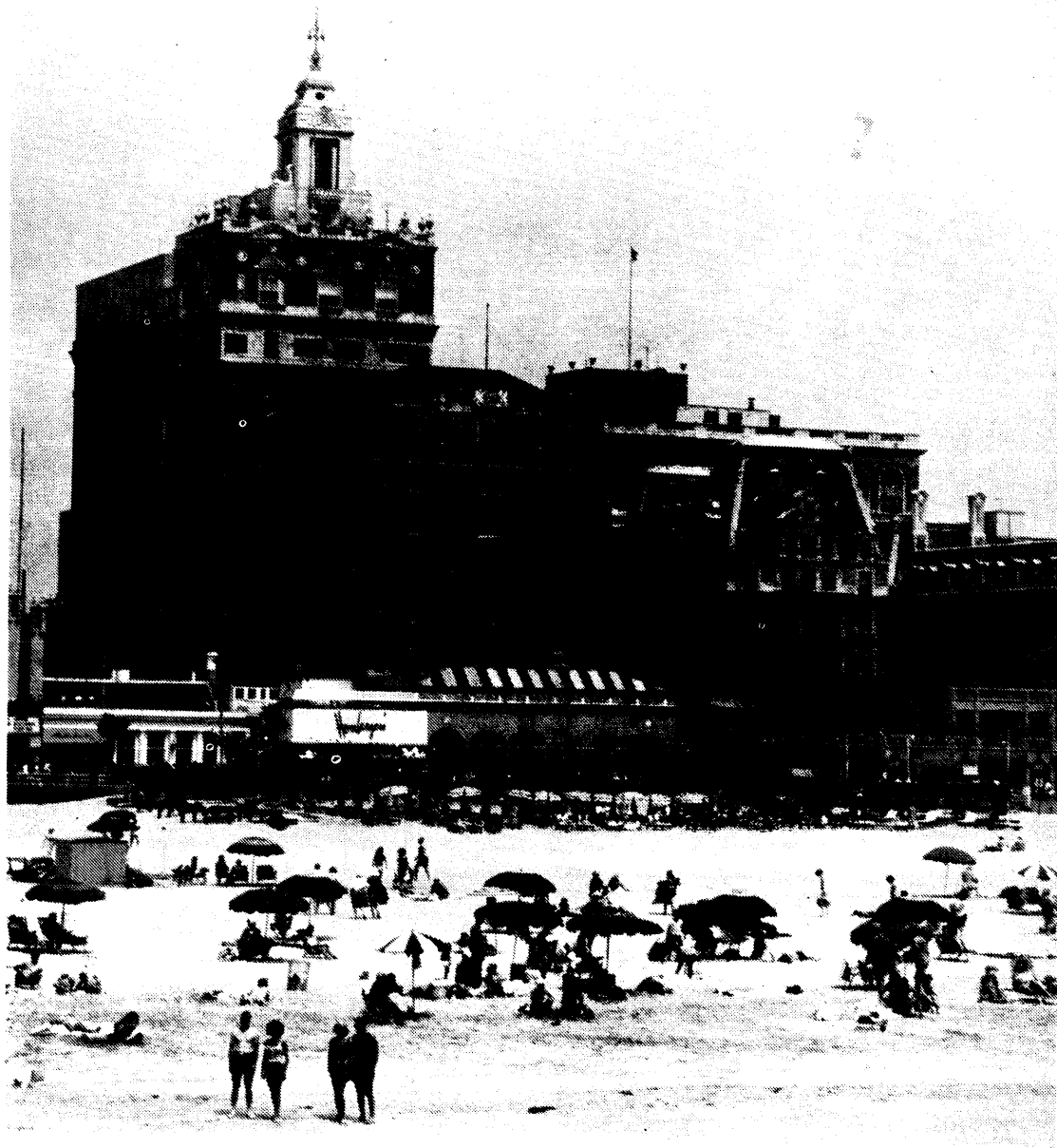
The Shelburne Hotel/Motel pictured above has been selected as Headquarters for the 1972 reunion being held in Atlantic City, New Jersey.