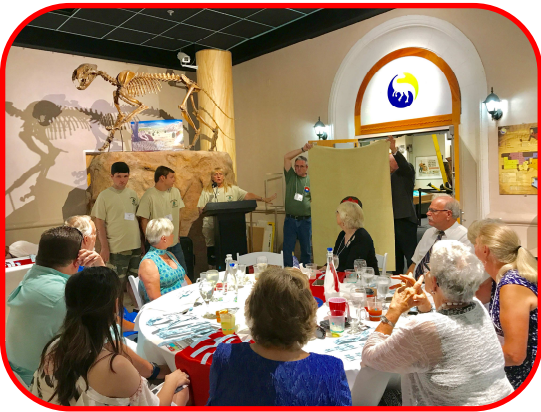
Banquet Sunday evening Arizona Museum of Natural History