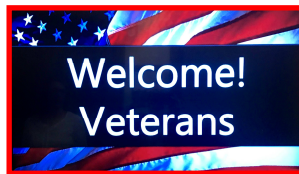
Meet and Greet