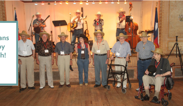
Our WW II veterans received cowboy hats at the ranch!