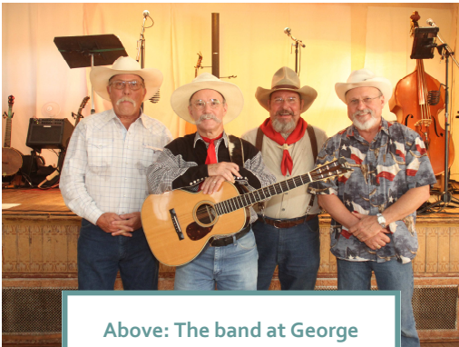
Above: The band at George Ranch