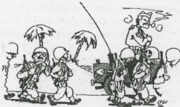
Cartoon 2. "Fer Christ' sake, Lootenint, don't look so damn zippy or we'll end up carryin' d'heavy weapons too."