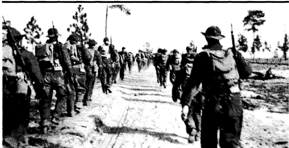
Co. C - 39th Infantry on a 20 Mile Hike in Fort Bragg North Carolina, 1941.

National Secretary, National Treasurer, and Editor of "The OCTOFOIL".