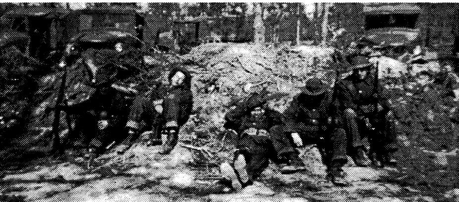
"Taking Five". Co. C - 39th Infantry, Fort Bragg, No. Carolina. 1941