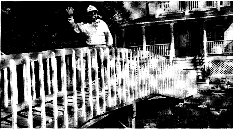
"I have my Contractor's helmet on with my Gold painted spud wrench clinched in my teeth of which I got with my 50 year pin 8 years ago." Picture taken June 2004