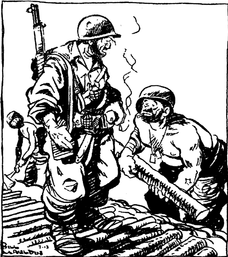
"Yer lucky. Yer learnin' a trade"

Sincerely grateful, The entire Membership of The NINTH Infantry Division Association, Inc.