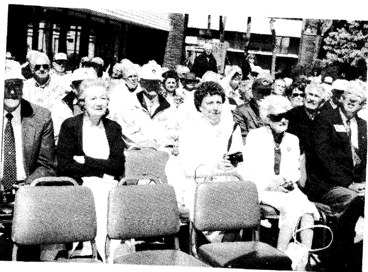
Members of the association are shown as they attended the Memorial Ceremony at the Hyannis Reunion held in May in Hyannis.