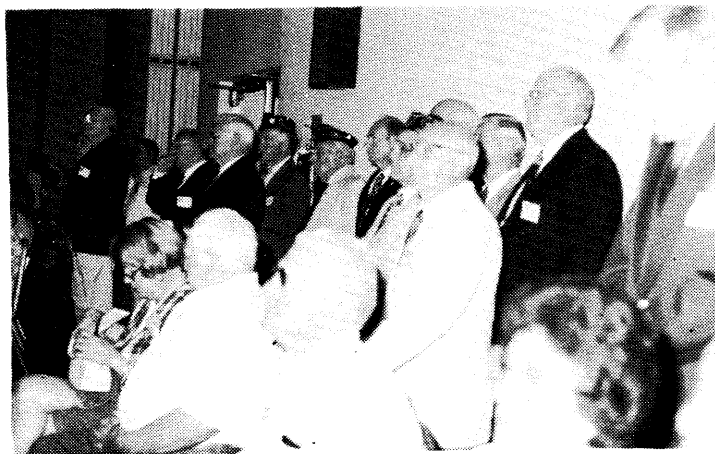
Members of the Association waiting to be called upon for their part in the Memorial Service, held in the Concord Hotel at 51st Reunion.