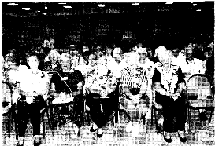
Awaiting the Memorial Program at the San Antonio Reunion, widows of members occupy the front row. It was one of the most impressive ceremony held at our reunions.