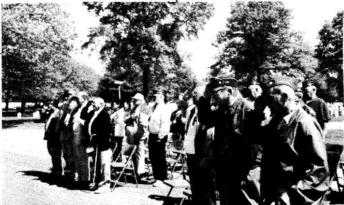
Members of the New York Chapter are shown saluting the colors being carried to the Memorial Services held at Pinelawn National Cemetery on Long Island, NY. The ceremony was held in May, an annual service held each year by members of the Chapter.