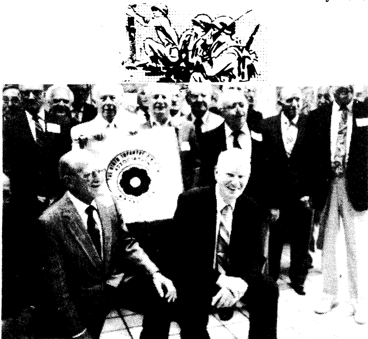
Members of the 9th Med Bn who held a mini-reunion in Pigeon Forge, Tn., last April are shown at the gathering. Story appears in Octofoil.

Deadline for next issue of Octofoil Oct. 20th