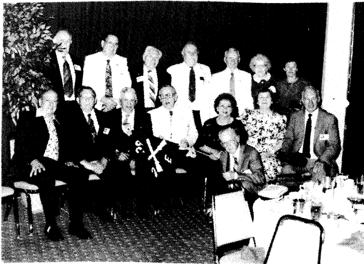
Members of Company E, 39th Inf are shown at the Fayetteville reunion.