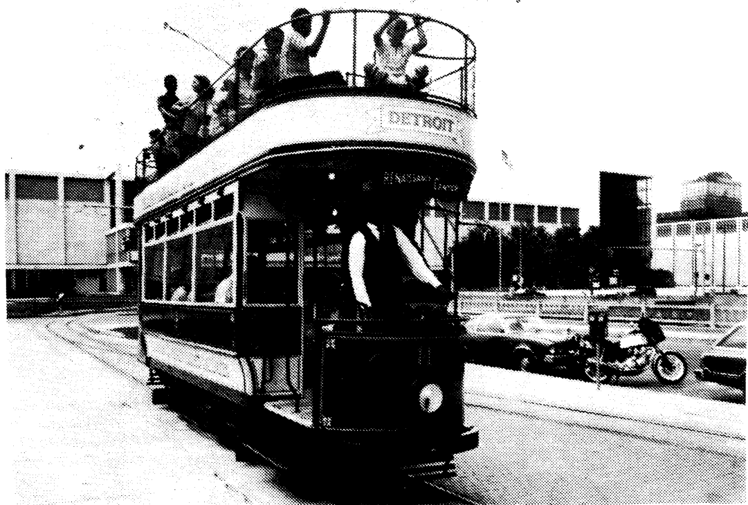
DETROIT'S TROLLEYS — Climb aboard one of the antique red and brass trolley cars and take a nostalgic trip through the heart of downtown Detroit. The trolley line runs from the Old Mariners' Church (on Jefferson Avenue, near the Renaissance Center), past Cobo Hall and continues nine blocks down Washington Boulevard to Grand Circus Park. The trolley cars offer a unique form of transportation to many of the hotels, restaurants and stores in downtown for only 45¢.