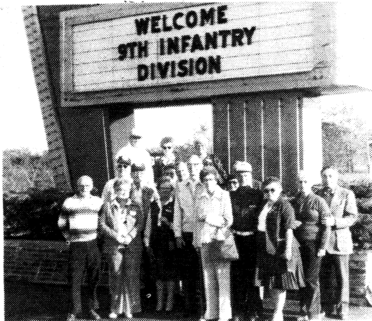
Illinois Chapter members and their wives are pictured at the Out-of-State meeting held by the Michigan-Illinois Chapters in Angola, Indiana on October 23, 1982.