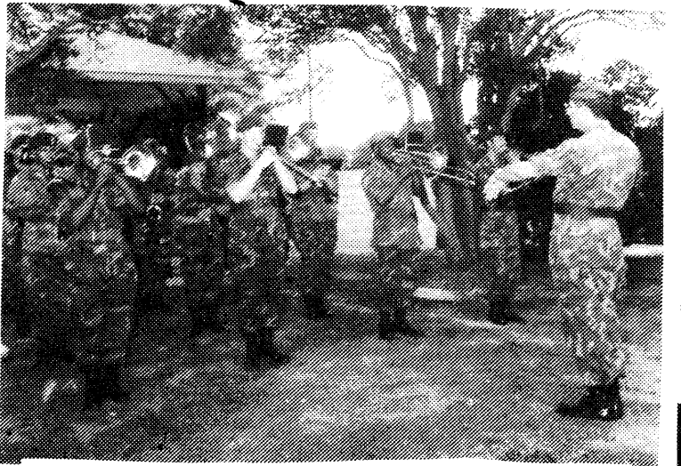
The 82nd Airborne Division's band that supplied the music for the Dedication ceremony.