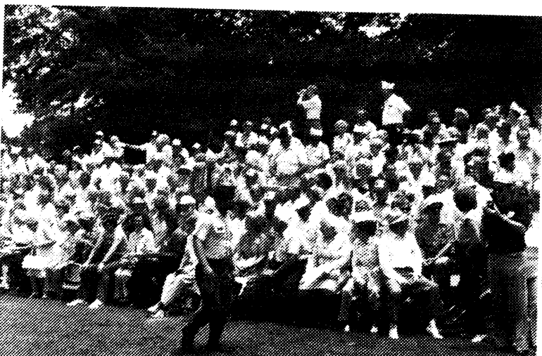
Members of the Glee Club of the 82nd Airborne Division as they entertained the members before the Dedication of the Memorial Marker.