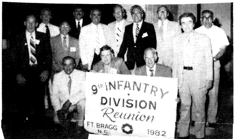
Members of the Anti-Tank Company of the 47th Infantry are shown as they gathered at the 37th reunion.