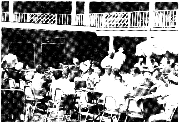
Shown at the "Clam bake" in Hyannis are a group that were seated outside of the dining hall.

When was the last time you wrote a letter to our Mail Call Column?