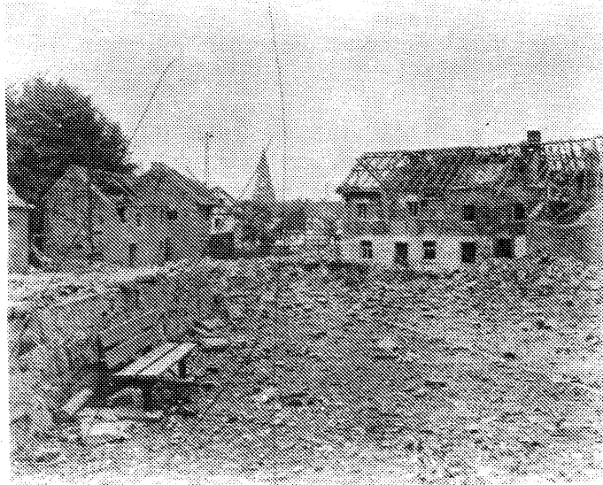
Schevenhutte which was shelled by the Germans — dated 9-22-44

Halfway back we ran into some of our men with a jeep, filled with mines, coming to meet us. When we told them what had happened, they waited until we heard a tracked vehicle coming up the road toward us. Almost certain it was a German tank, we continued back to Schevenhutte, "changing our plans for the time being."