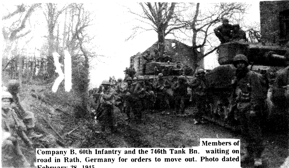
Members of Company B, 60th Infantry and the 746th Tank Bn. waiting on road in Rath, Germany for orders to move out. Photo dated February 28, 1945.