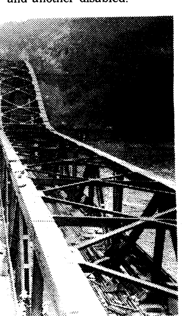
A view from tower at the West end of the Remagen Bridge spanning the Rhine at Remagen Germany. The photo is dated March 15, 1945. The bridge collapsed on March 17th.

Despite this wholesale surrendering, a patrol sent by the 9th Reconnaissance Troop over the Mulde was met with heavy anti-tank, machine gun and small arms fire. Three M-8 Recon Cars were knocked out, and another disabled.