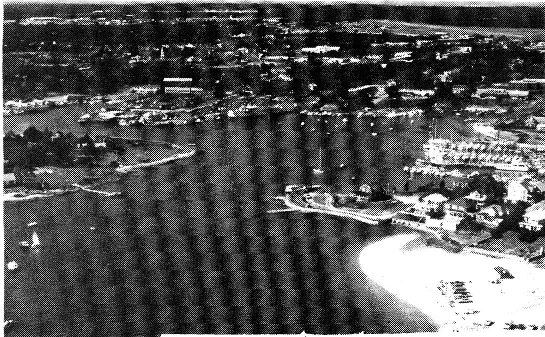
Aerial view of Hyannis Inner Harbor-site for the 1981 reunion.