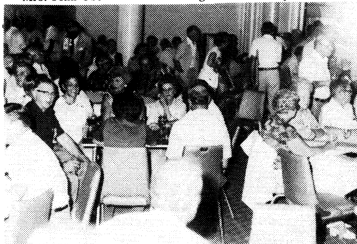
Hail-Hail the gangs all here: The Thursday Welcoming Party.