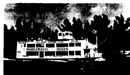
Paddlewheel Queen's starlight cruise features steak dinners and dancing, plus great banjo entertainment.

Fishermen can take their pick of four fishing piers, the longest of which is in Pompano Beach, jutting a thousand feet into the Atlantic. Anglers can rent rod, reel and tackle for $3.28.