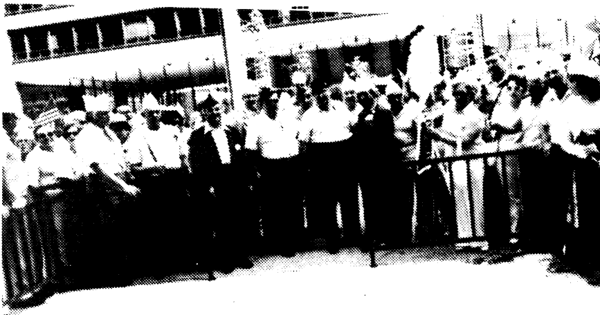
The members gathered for the placing of the wreath at the Memorial Service.