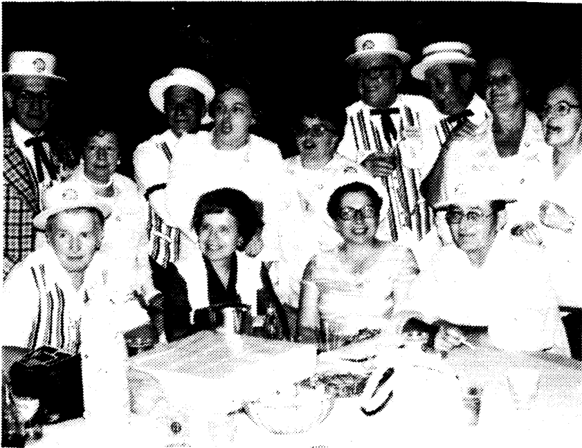
A happy group from the Illinois Chapter at the sing-a-long- at the first night's reception.