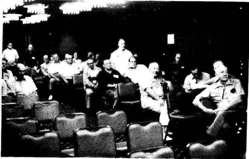
Here's some of the members getting ready for the business session at the reunion.