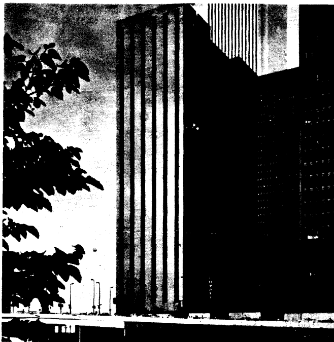
This is IT FELLA'S-OUR C.P.