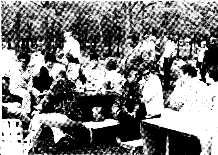
A picnic was held at Bethpage State Park a few miles from the National Cemetery after the ceremonies. The gals had a chance to sit around while the guys did the cooking.