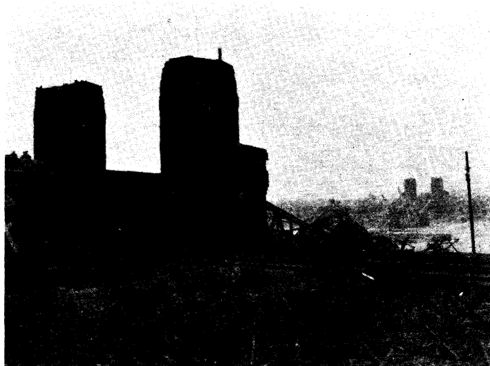
The Remagen Bridge shortly after the bridge collapsed as seen from the East side of the Rhine. March 1945.

At this time a new device was introduced by the British. As I entered another room in a different house, a soldier was about to light what appeared to be an S-mine. However, it was a can of split pea soup with a fuse down through the center of the can. After the fuse burned down through the can, the can was opened and there in the can's contents was hot pea soup. Magnificent, because you couldn't see the light burning that heated the soup and imagine having hot chow in the trenches?