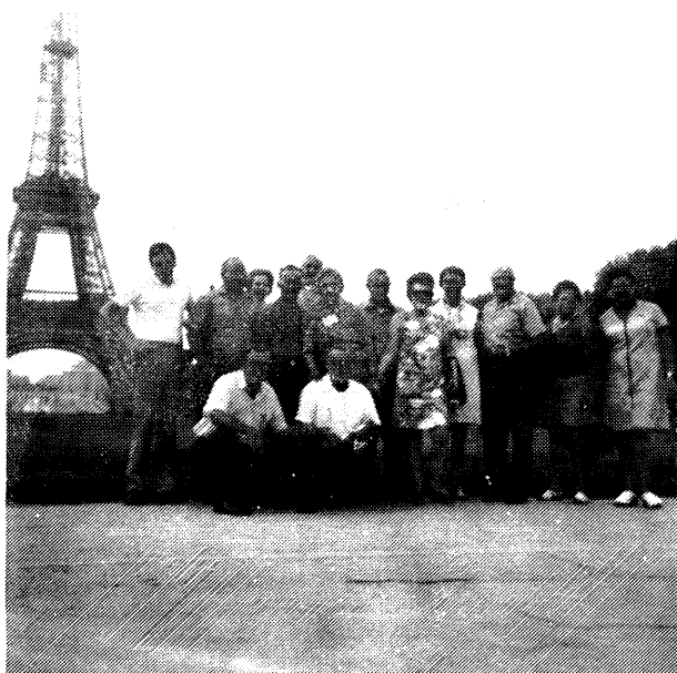
A group in front of the Eiffel Tower.