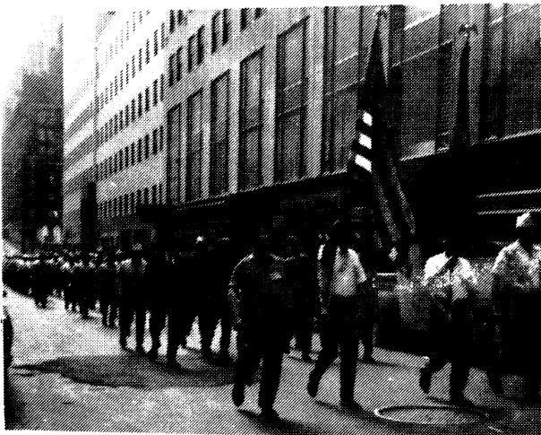
With colors leading the troops start the parade to the Memorial Service.