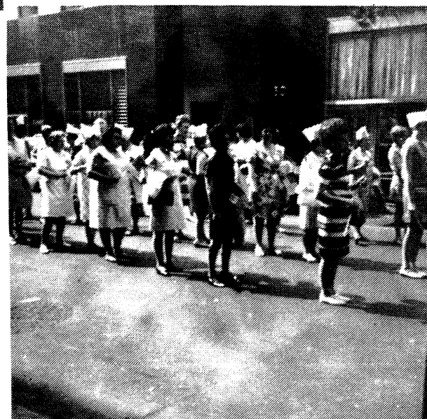
The Ladies Auxiliary were in the line of march with the men.

Remember The Dates 1971 Reunion Springfield July 29-31