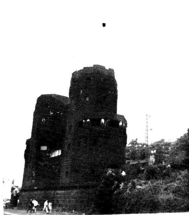
This is what is left of the Bridge at Remagen.