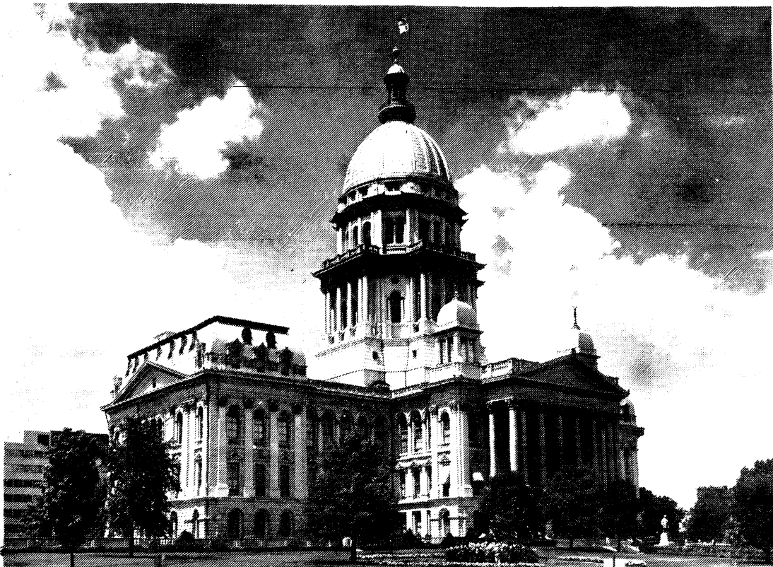
The Illinois Chapter members announced at the New York reunion that they have selected the city of Springfield for next year's gathering of the clans. Shown here is the State Capital of Illinois.