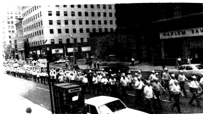
With heads held high the troops march to the Memorial Services.