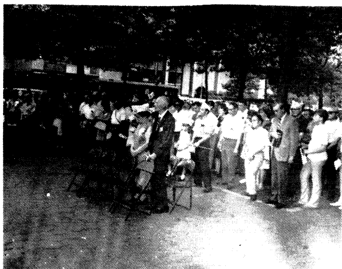
The troops gather to remember our dead.