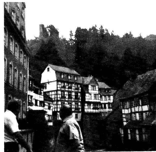
Quinn and Jack Scully view the scene in Monschau from the same angle that appears in "8 Stars to Victory". (page 278)