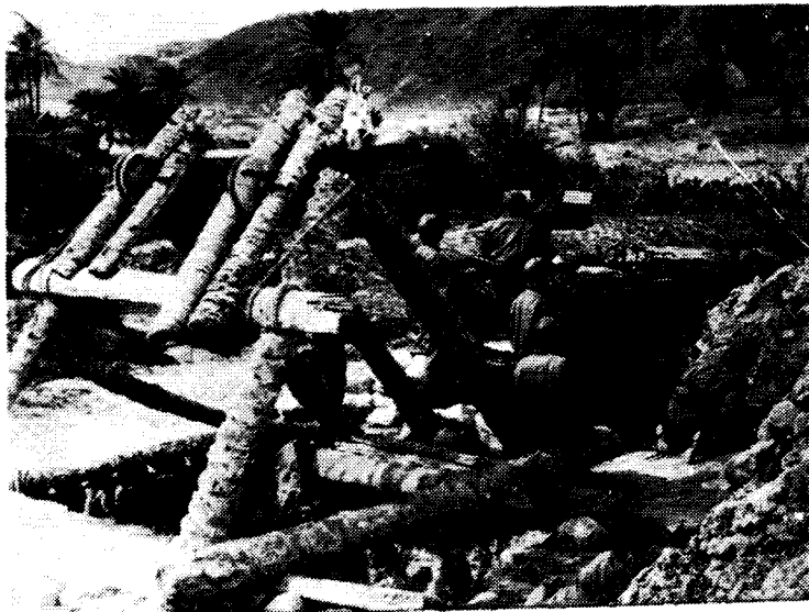
Gun Crew Alert, El Guettar, Tunisia