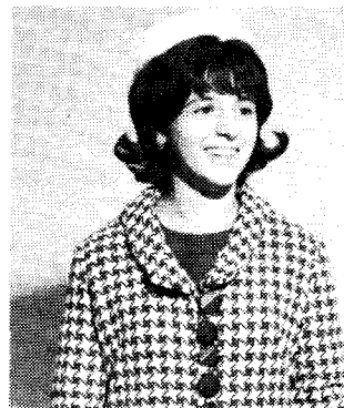
TALENTED YOUNG LADY

Edward Ianetti--"moved" says the Post Office