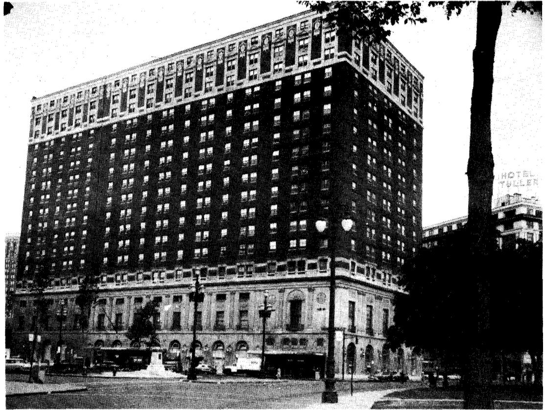
The Statler-Hilton, Headquarters for '68