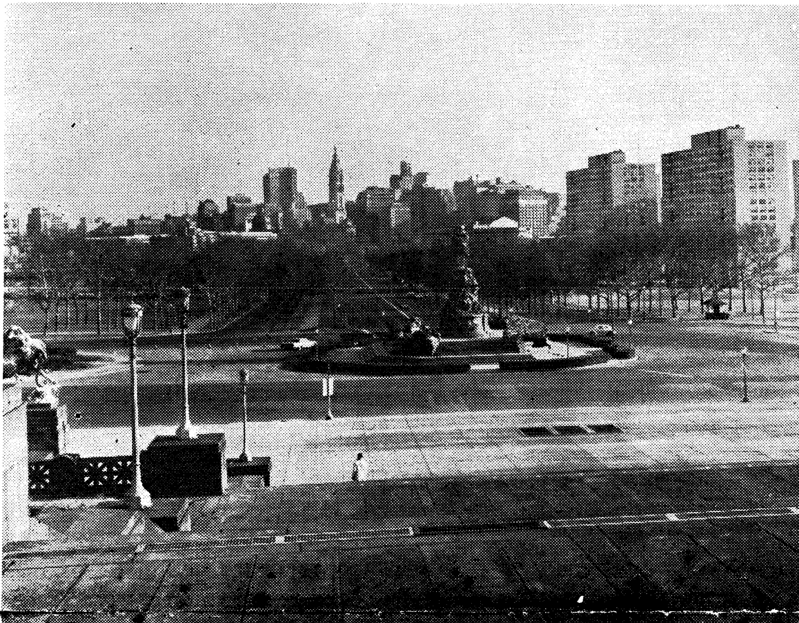
The City of Brotherly Love is a large metropolitan city but there's still open areas left where a fellow can relax and take a deep breath of free air at times. The above picture shows the skyline of Central Philadelphia, as viewed from the terrace of the Museum of Art, looking down the Benjamin Franklin Parkway.