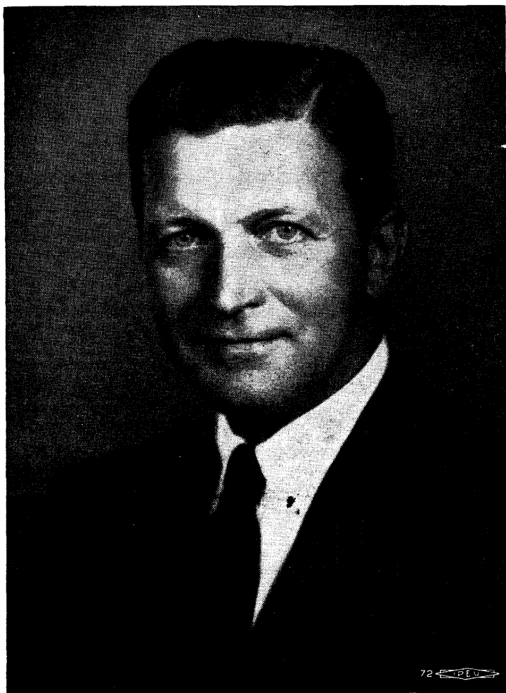
HIS EXCELLENCY—THE HONORABLE OTTO KERNER Governor for the State of Illinois An Active Member of the Illinois Chapter