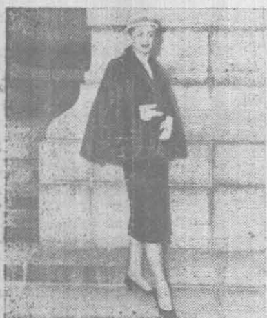
Model wearing clothes shown at fashion show.