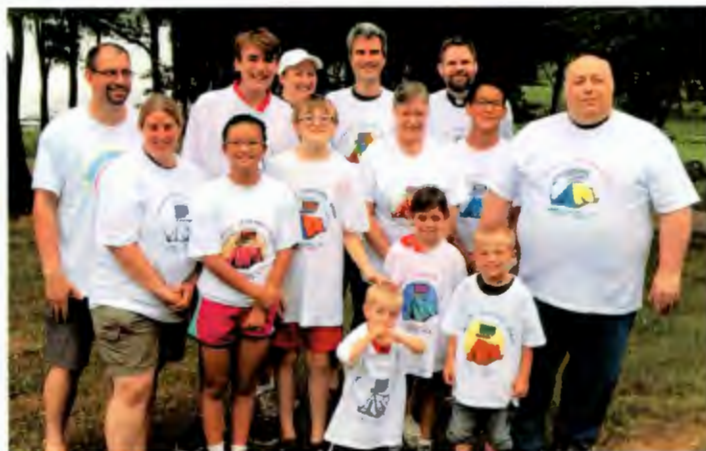
▲ 2018 CSH VBS Camp Group Picture

Hello! Did you hear God's Message? Message heard! - This led to form Catholic Spiritual Hands (CSH)'s vision to set first Catholic Deaf Family Camp at Green Lake, WI during July 19-22 - that included whole family who knows sign language. This is the first Vacation Bible School (VBS) camp for the whole family to have a fun, learning experience.