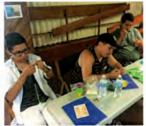
▲ We even had down time to create our own rosaries!