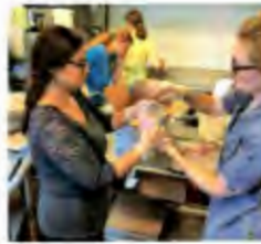
▲ Working hard to sort through foods.