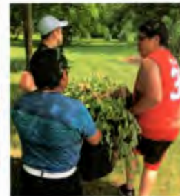
◀ Taking turns to carry the weeds to the Decompost.