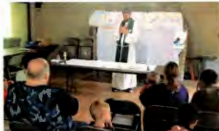
▲ One of our Daily Masses, held at the Tea House.