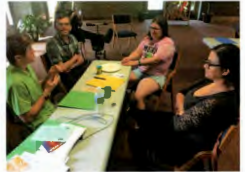
▲ When could we ever have opportunities like this: to share our Catholic faith with others who are also Deaf, Catholic, and Young Adults?