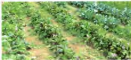
▲ See what a big difference it is now than before? You can see the vegetables!

Sunday, we had closing Mass at the Shrine, and it was GREAT! We learned more about how to pray and about many more young adult saints. We were sad to leave the retreat. I thought it was great and a good weekend full of many great lessons and memories to remember.