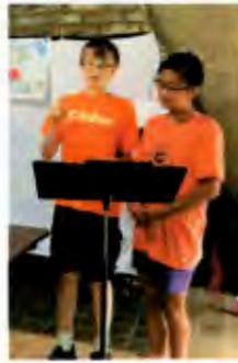
▲ Doing the readings for Mass.

There will be Second Catholic Deaf Family camp - June 20-23, 2019!! It will be at the same place where we had our first VBS camp, Green Lake, WI. More details will be shared and posted on our website, cs.h.f.a.i.t.h sometime in October. I can be reached by email at catholicspiritualhands@gmail.com if you want additional information or wish to help to make this happen!