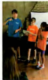
▲ Doing skit based Bible story of Lydia.