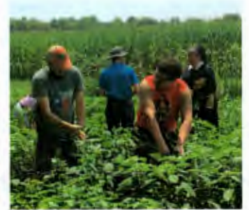
▲ See how the garden is full: you could not tell the difference between the weeds and vegetables.