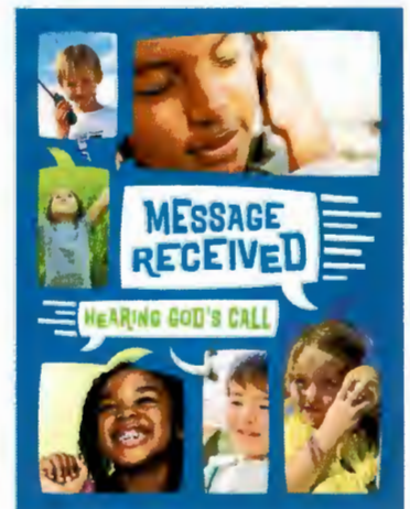
▲ The theme for VBS 2018

It was three full days of camp with various activities that included 5 different sessions along with daily Masses and free times.