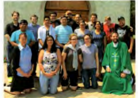
▲ Our group photo in front of the Shrine.