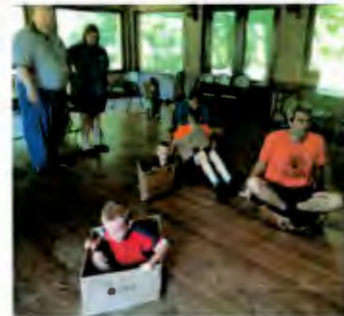
◀ One of the daily activities -- making cardboard boats and testing it.