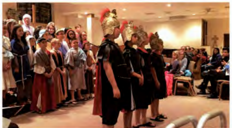
▲ This is the grand conclusion, with each group departing to the back with an amazing song!