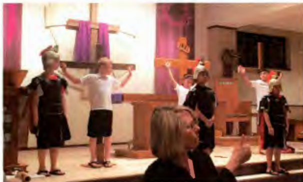
▲ The Crucifixion scene was incredibly moving.