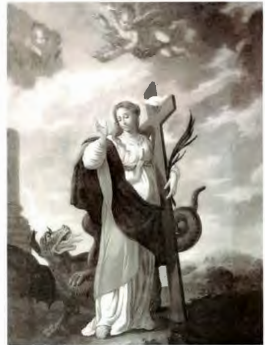
Invocation of the Saints

℟. And to remain steadfast in the love of Christ, * in order to preserve this great gift of God. * Implore for me the grace of perseverance in prayer, * distrust of myself, * and flight from the occasions of sin, * and finally the grace of a good death, * so that in heaven I may * "follow the Lamb whithersoever He goeth." * Amen.