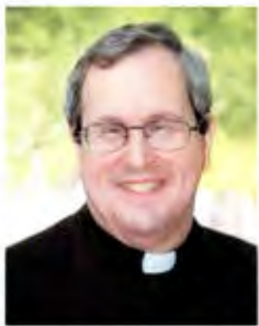
Fr. Robert Spitzer

A powerful moment was when all the men and boys who were thinking of a possible vocation in the priesthood, were invited to go up on stage. Man after man, boy after boy, all went on stage, filling up the stage until it was crowded! We, the Deaf men, were so touched, that many got emotional. A special prayer was said for them. Please keep these men and boys in your prayers for their future!