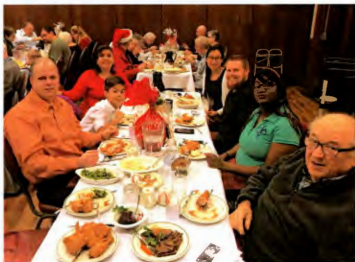
▲ The food was delicious. Sixty-five people attended the dinner.