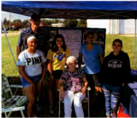
▲ Volunteers at the 3 Deaf Club Picnic Catholic booth at Darien in August.