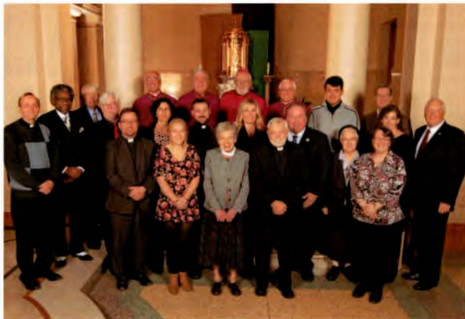
▲ Group photo of the 2017 Vatican II Award recipients.