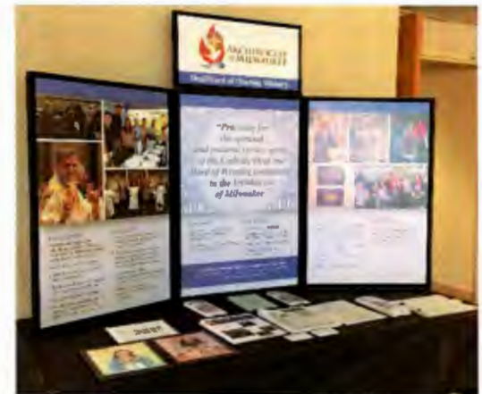
▲ Deaf/Hard of Hearing Ministry Office display board during Deaf Awareness Week.