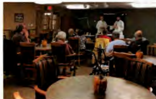
▲ Mass at Water Tower View.