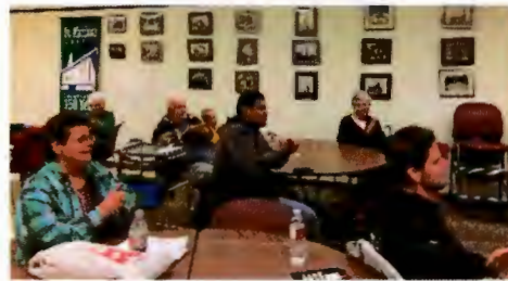
▲ Participants in the Ultreya.