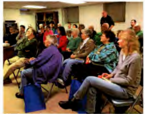
▲ Participants at the Lenten Retreat.