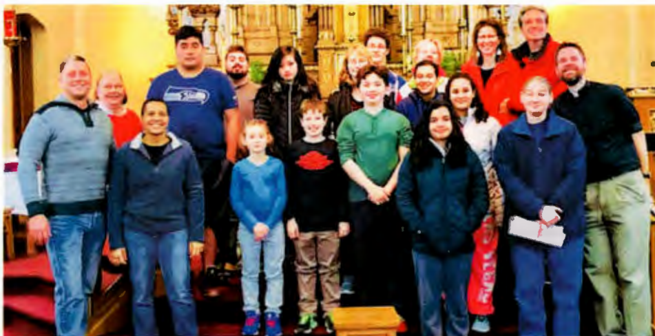
▲ Catholic Religious Ed WSD group photo celebrating Christ the King Deaf Mass.