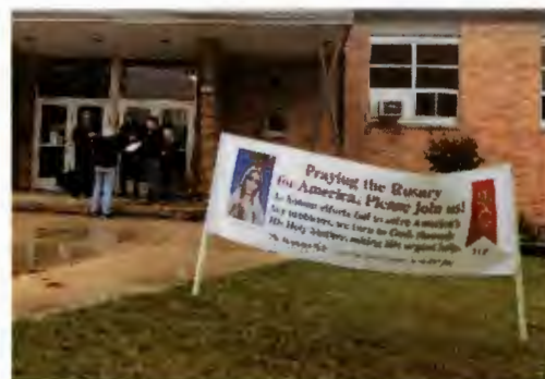
▲ Praying the Rosary during the month of October.