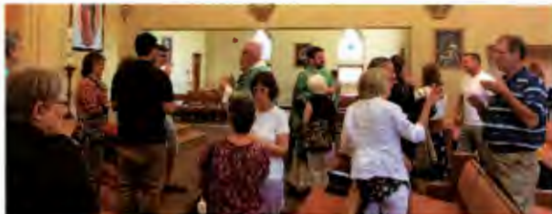
◀ Gathering after Mass at St. Mary Immaculate Conception Church in West Bend, WI.