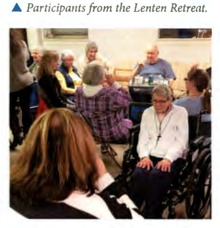
A Participants break into group discussions.