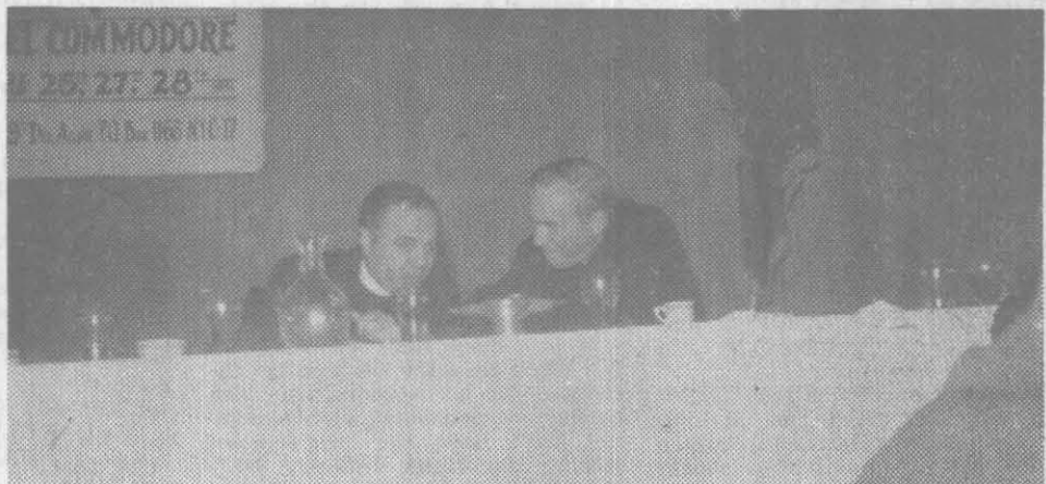
"STILL BUCKING FOR MONSIGNOR"