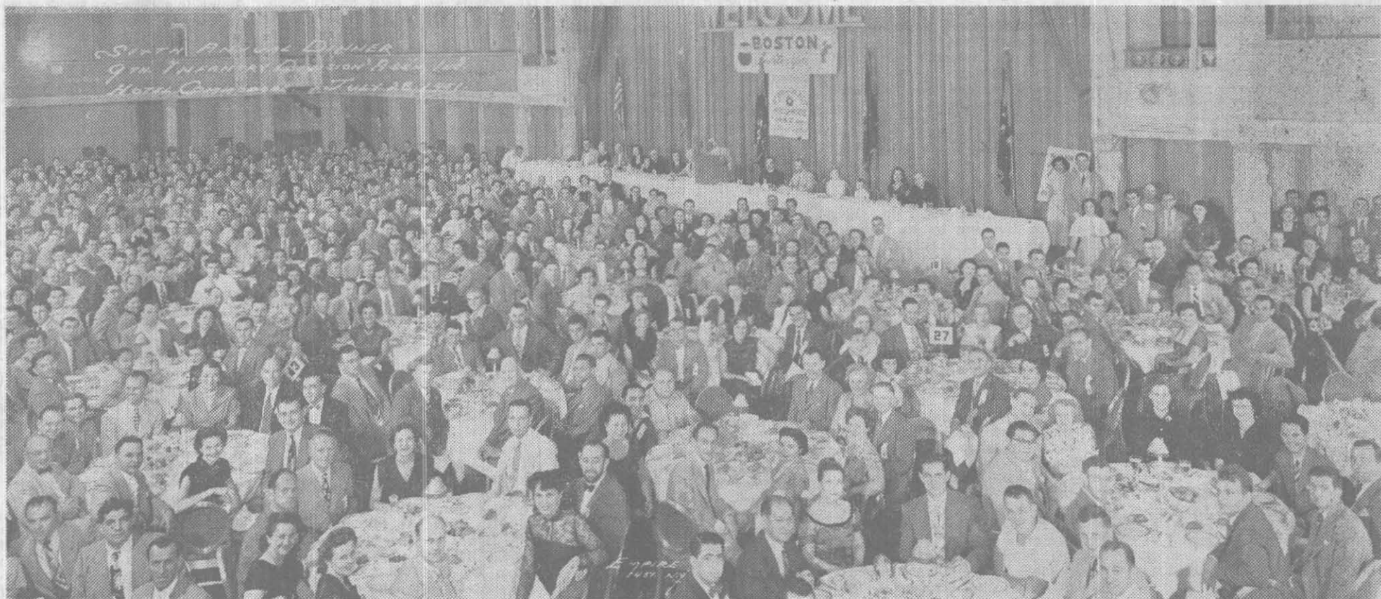
SIXTH ANNUAL BANQUET, NINTH INFANTRY DIVISION