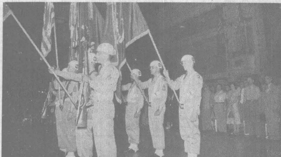
SALUTE TO COLORS DURING MEMORIAL SERVICES