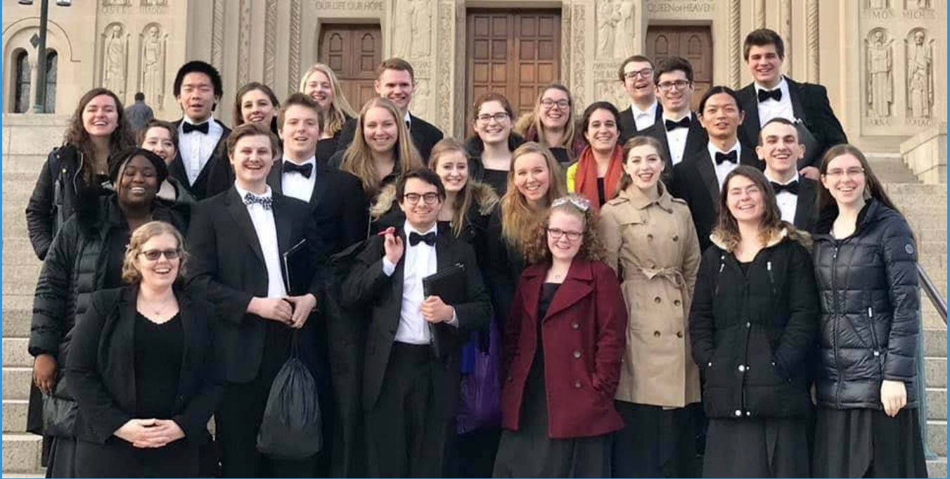
Tour Fun! The College Choir and Chamber Singers outside of the Basilica of the National Shrine in Washington, D.C., before singing the postlude for the Saturday 5:15 Mass on March 2 nd , 2019.