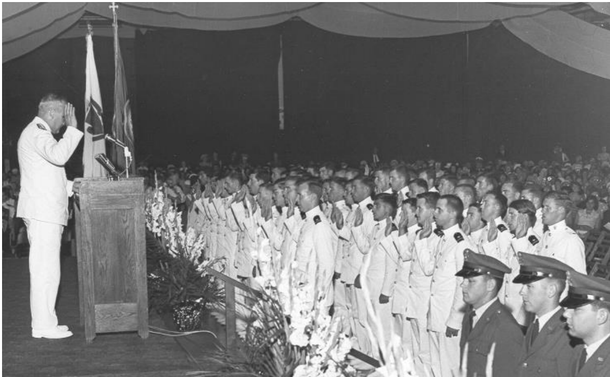
Class of 1965 Commissioning