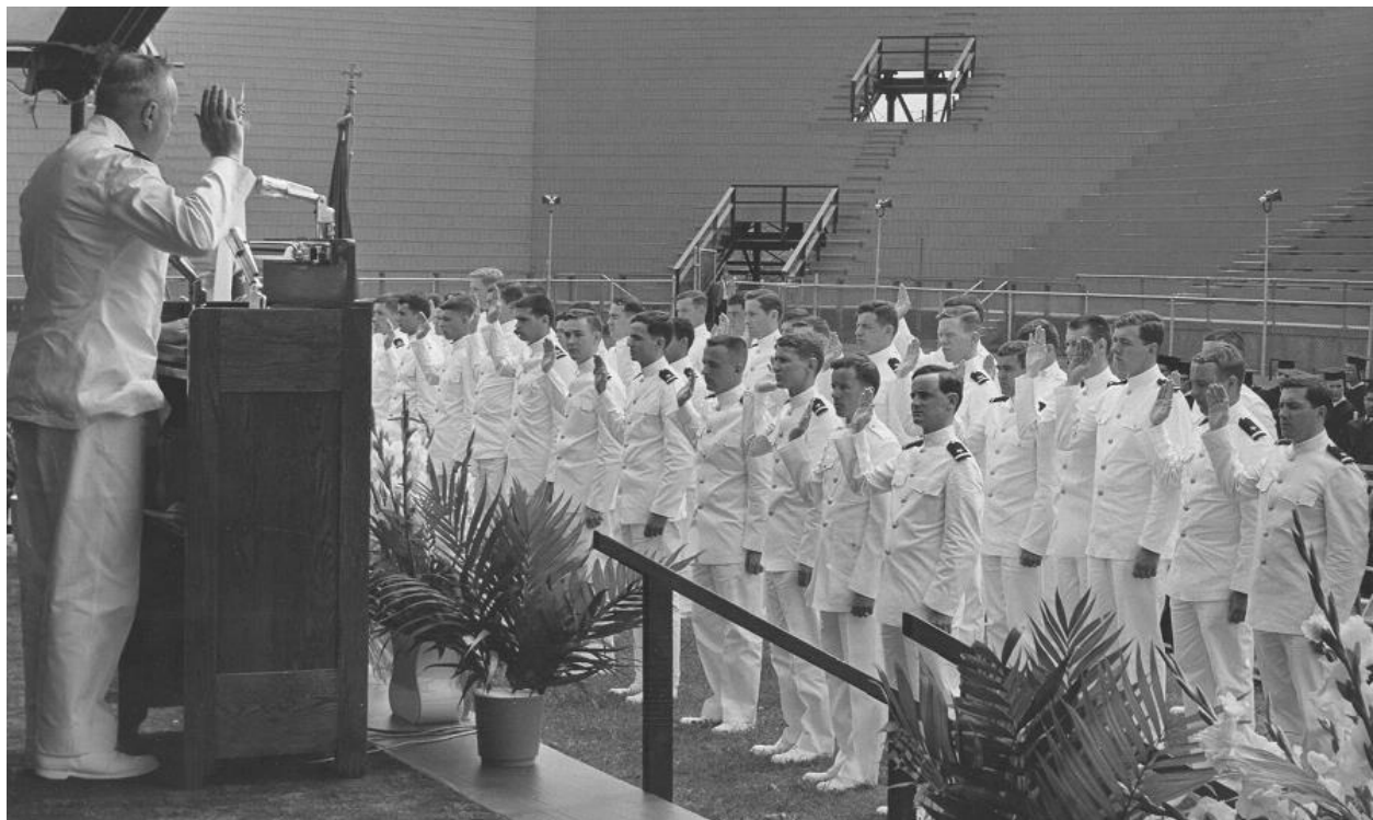
Class of 1966 Commissioning